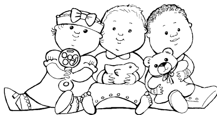
Births in the Church Family